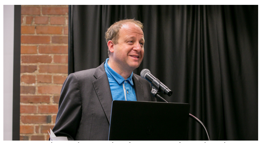
Governor Elect Polis joined us for our Best for Colorado Launch Party in November.