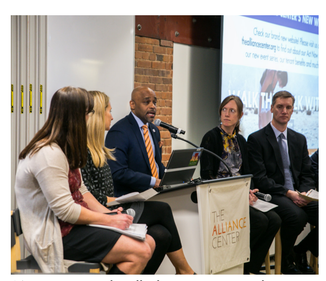
Mayor Hancock rolled out Denver's Climate Action Plan here in January.