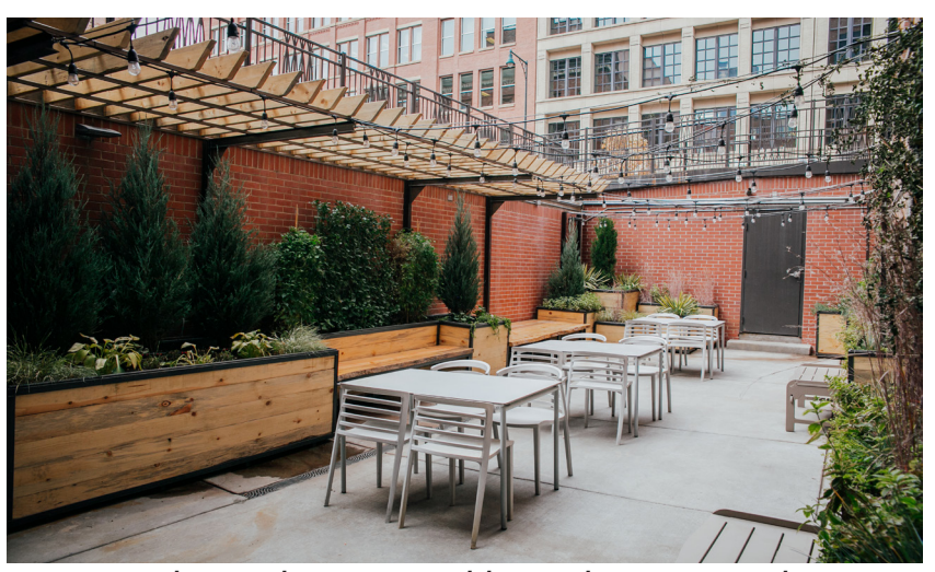
We opened our urban sustainable garden in our sunken patio space in June.