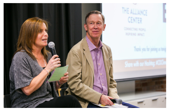
Governor Hickenlooper visited in June to discuss Colorado's Climate Action Plan.